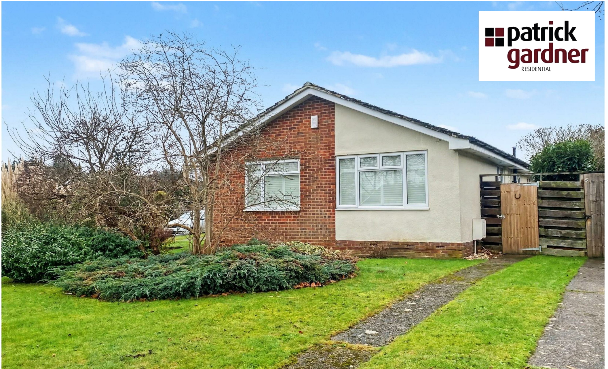
9 Candy Croft, Great Bookham, Surrey, KT23 4BZ